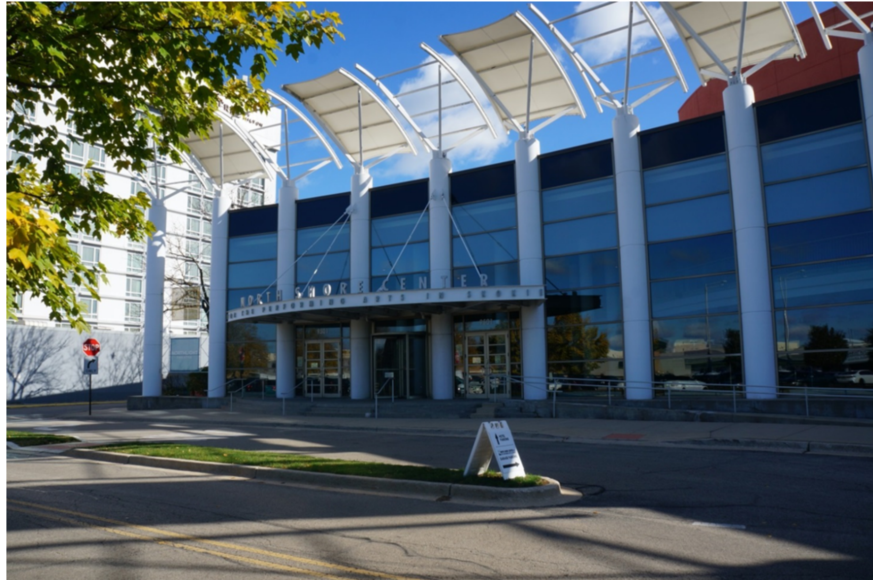
Image Description: A photograph of the North Shore Center for the Performing Arts. The building's walls are made of white columns that have large glass windows between them. At the top of the theatre are alternating white panels which provide shade for the theatre. It is a sunny day, but the theatre is shaded. There is a tree poking out on the left.

Northlight Theatre is located within the North Shore Center for the Performing Arts. If you see this building with lots of windows, you are in the right place.