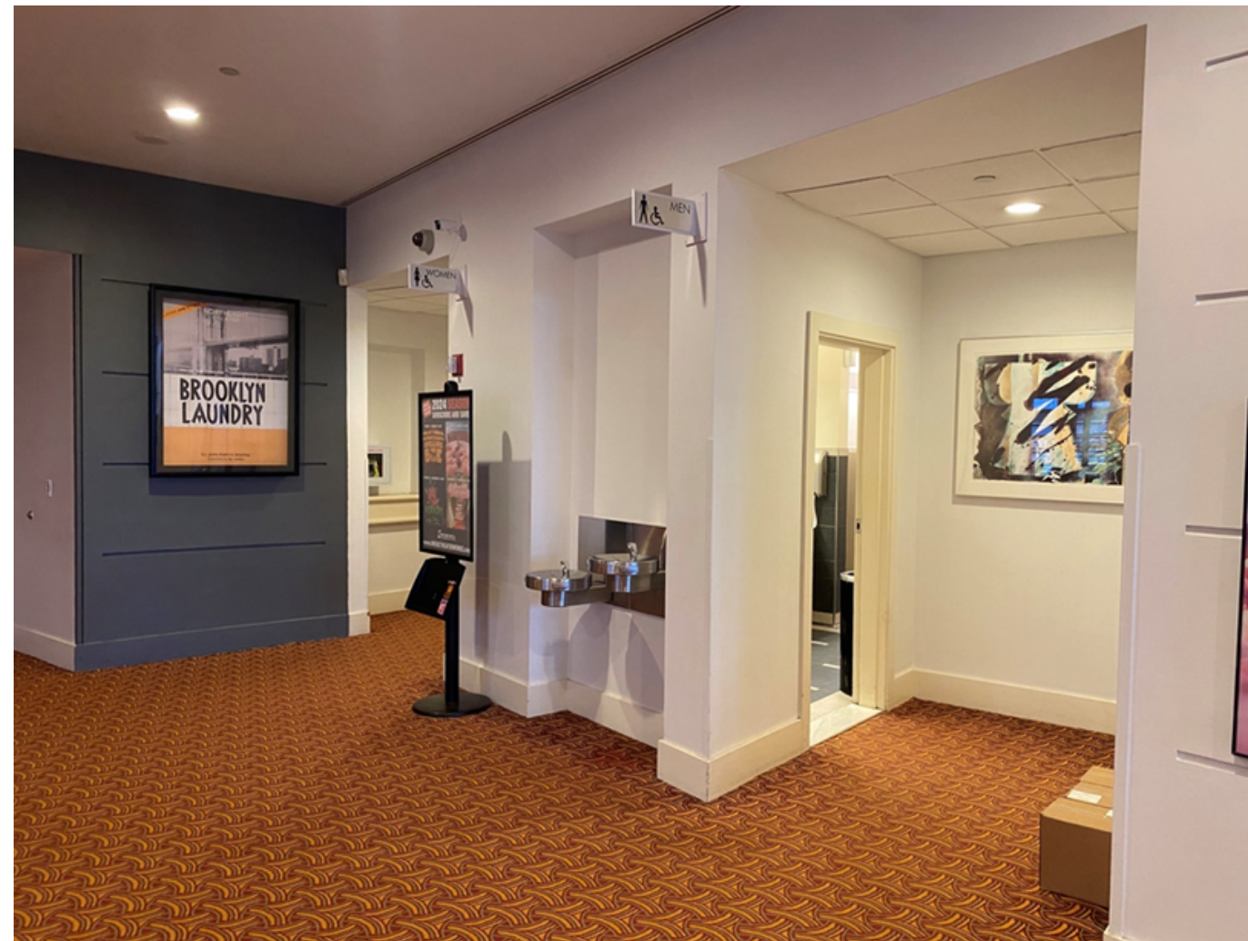
Image Description: A photograph of the entrances to the bathrooms at Northlight Theatre. Signs designate the bathroom on the left for “Women” and the bathroom on the right for “Men.” Both bathrooms have wheelchair accessible stalls. Between the two bathrooms, there are two water fountains. The walls are decorated with posters and advertisements.

The bathrooms are located in the lobby outside the North Theatre. If you need to use the bathroom during the performance, you can leave and use these bathrooms. You can also use the water fountain to get a drink of water.