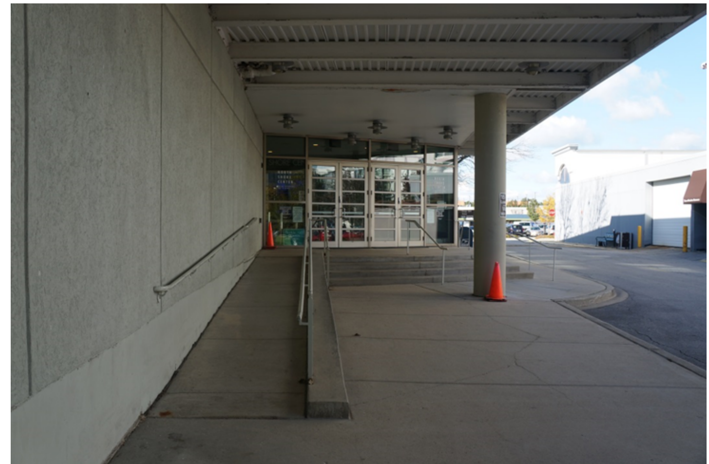
Image Description: The first photograph is of Northlight's parking lot. A brown sign which reads "Theater Parking Only" in white letters sits on a bed of red gravel. Behind the sign are several cars, the two most noticeable ones are blue. It is a beautiful day with lots of clouds in the sky. The second photograph shows the doors to the building. The doors are made of glass. There are a few concrete steps with gray handrails leading up to the glass doors, and a long concrete ramp off to the left.