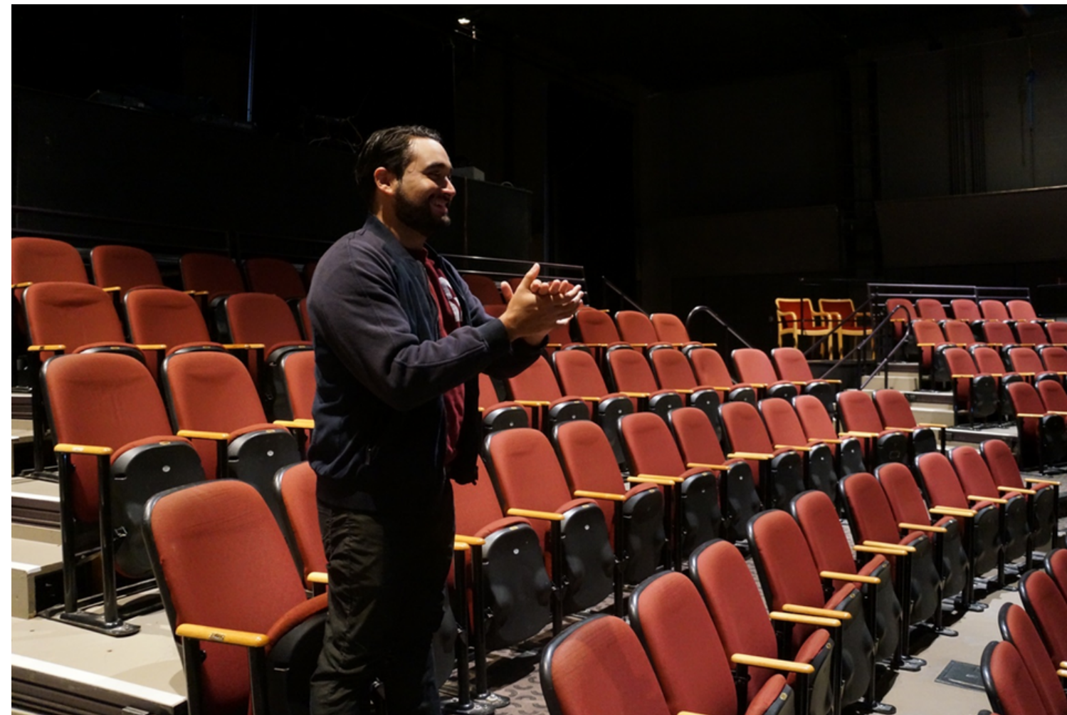
Image Description: A photograph of a young man standing in front of the same chair from the previous picture. His hands are clasped as if he has been clapping.

Sit back, relax, and enjoy the show. If you look in your playbill, you will see if the show is going to have an intermission or a break. After the show is over, you can clap for the performers to show your appreciation.