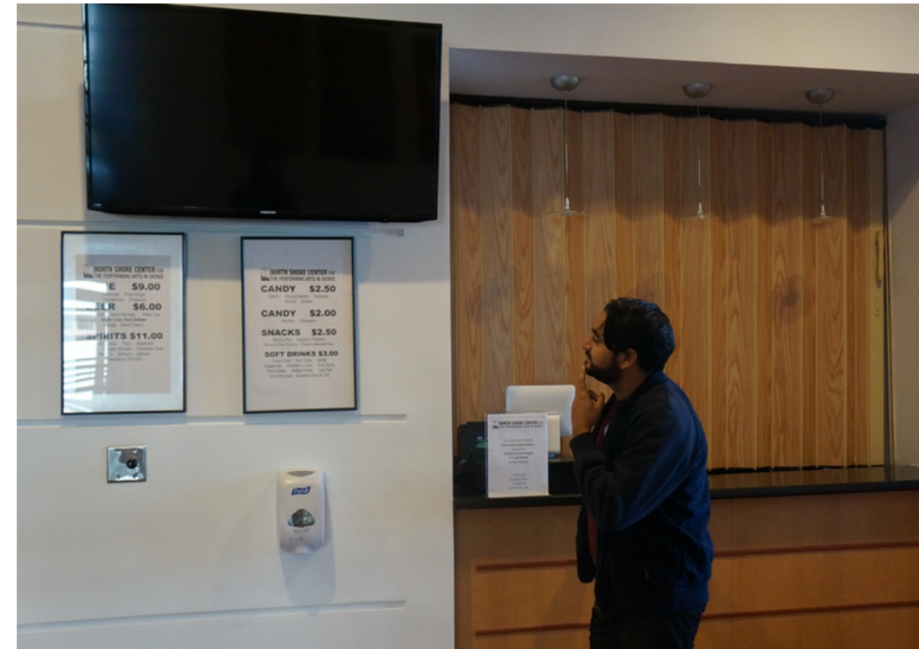
Image Description: There are two photographs on this page. The first shows two friends sitting at a table in the Northlight lobby. They are conversing with their hands out with a large staircase behind them. The second photo shows a young man at the Northlight concession stand. He looks at a white posterboard with a menu which hangs on a wall with a TV above it. To the right of the TV is the concession stand which has brown paneling.