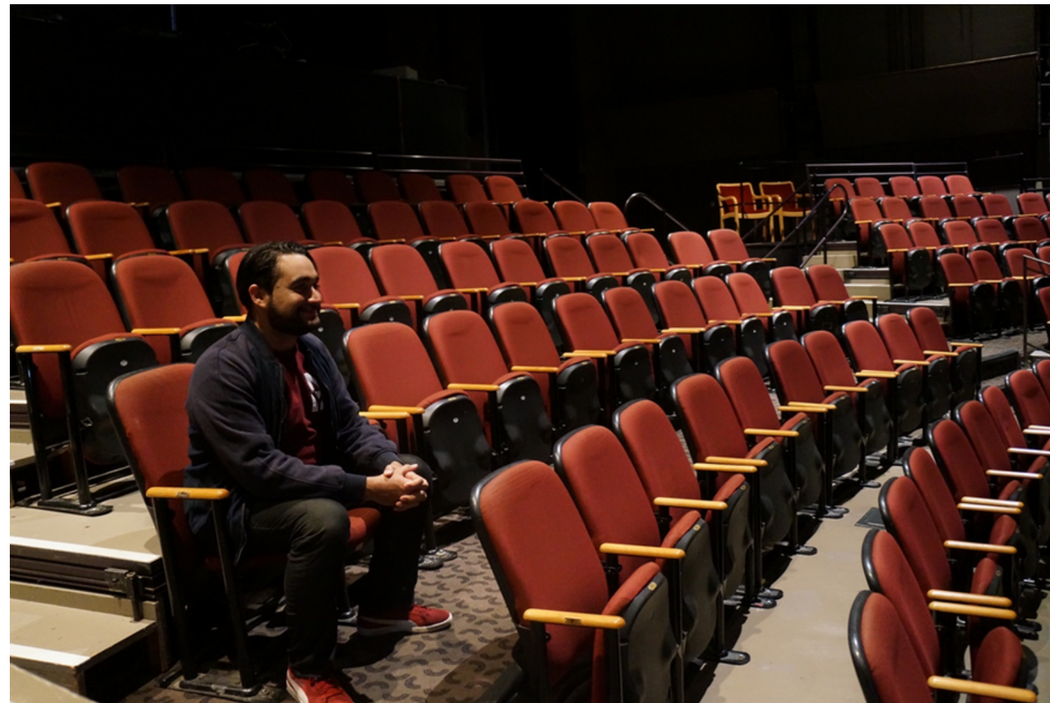
Image Description: A photograph of a young man sitting in one of the red seats from the previous photo. He has his hands on his knees and is leaning forward towards the stage.

A couple of moments before the show starts, you will hear a curtain speech which will let you know that the show is about to begin. This might be done live by a Northlight staff member or it might be recorded. The show may start on time or they might need to wait up to fifteen minutes until everything is ready.