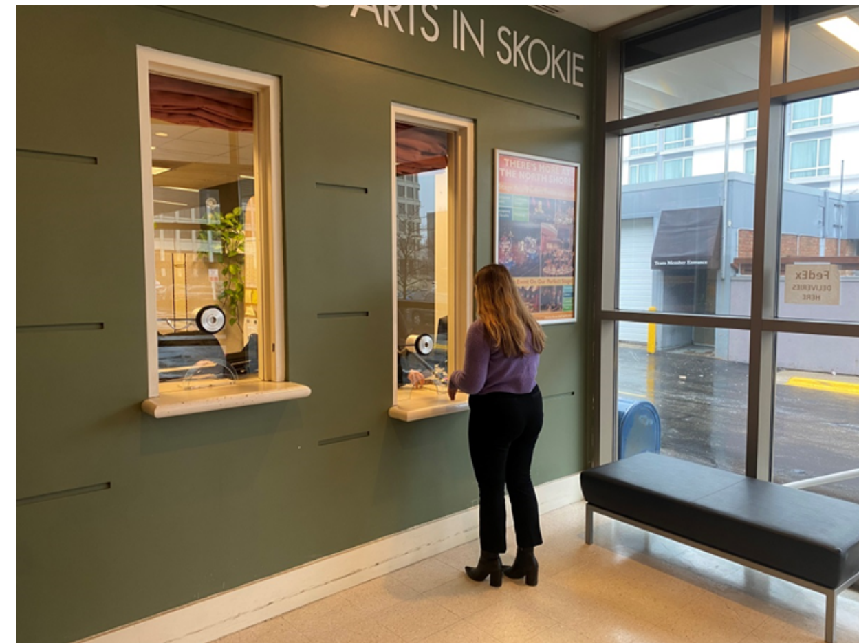
Image Description: There are two photos on the page. The first is a wide shot of a man entering North Shore Center through the glass doors from the previous photo. The doors sit on a raised piece of concrete with four gray handrails. The second picture shows a young woman at a box office window with a microphone box. She reaches towards the window to receive her ticket. To her left, there is a second box office window.