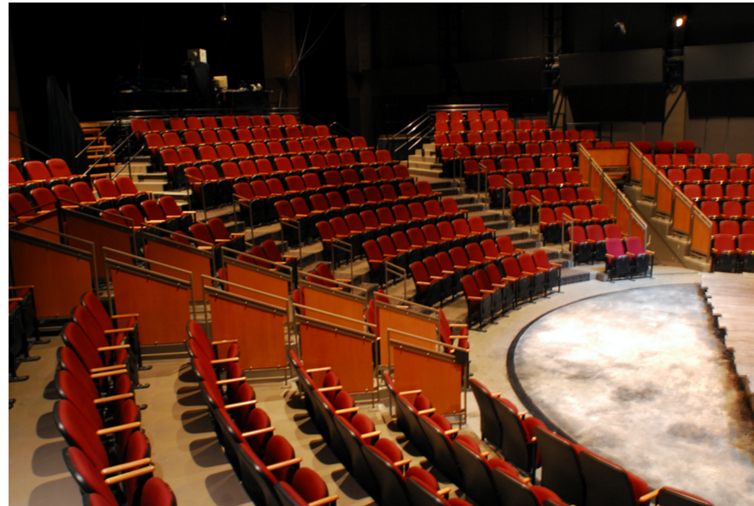
Image Description: An image of the interior of Northlight Theatre. About 300 red seats are arranged in a semi-circular pattern around a circular gray stage. There are two hallways in between the seats which the actors may use for entrances.

Once you are in the theatre, an usher will give you your playbill which has information on the show. If you show them your ticket, they can help you find which seat will be yours for the performance. This is a great opportunity to get comfortable and relax before the show.