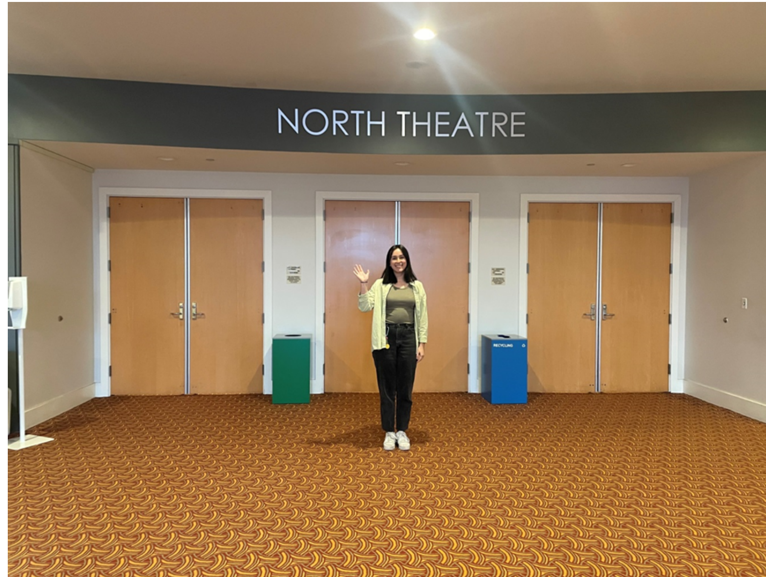
Image Description: A young woman with shoulder-length brown hair smiles and uses her right hand to wave hello to the camera in front of three sets of brown doors. She wears a light green button-down shirt and black pants. A sign above her reads “North Theatre.”

Welcome to Northlight Theatre. We are so excited to have you attend our show! This social story will help to prepare you for different elements of the production.