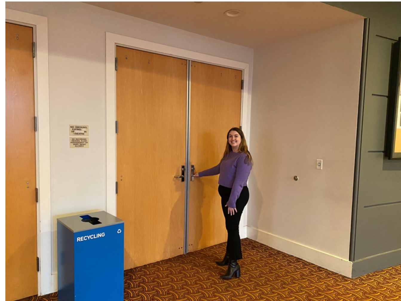
Image Description: A photograph of a young woman with a purple sweater walking into the North Theatre. She grasps the handle of the light brown doors which are surrounded by a white wall. To the left, there is a recycling bin.

When you are ready to enter the theatre to see the show, go through the brown doors which say “North Theatre.” We recommend going into the theatre 10 minutes before the show begins. This is a great time to let an employee know if you have any accessibility needs.