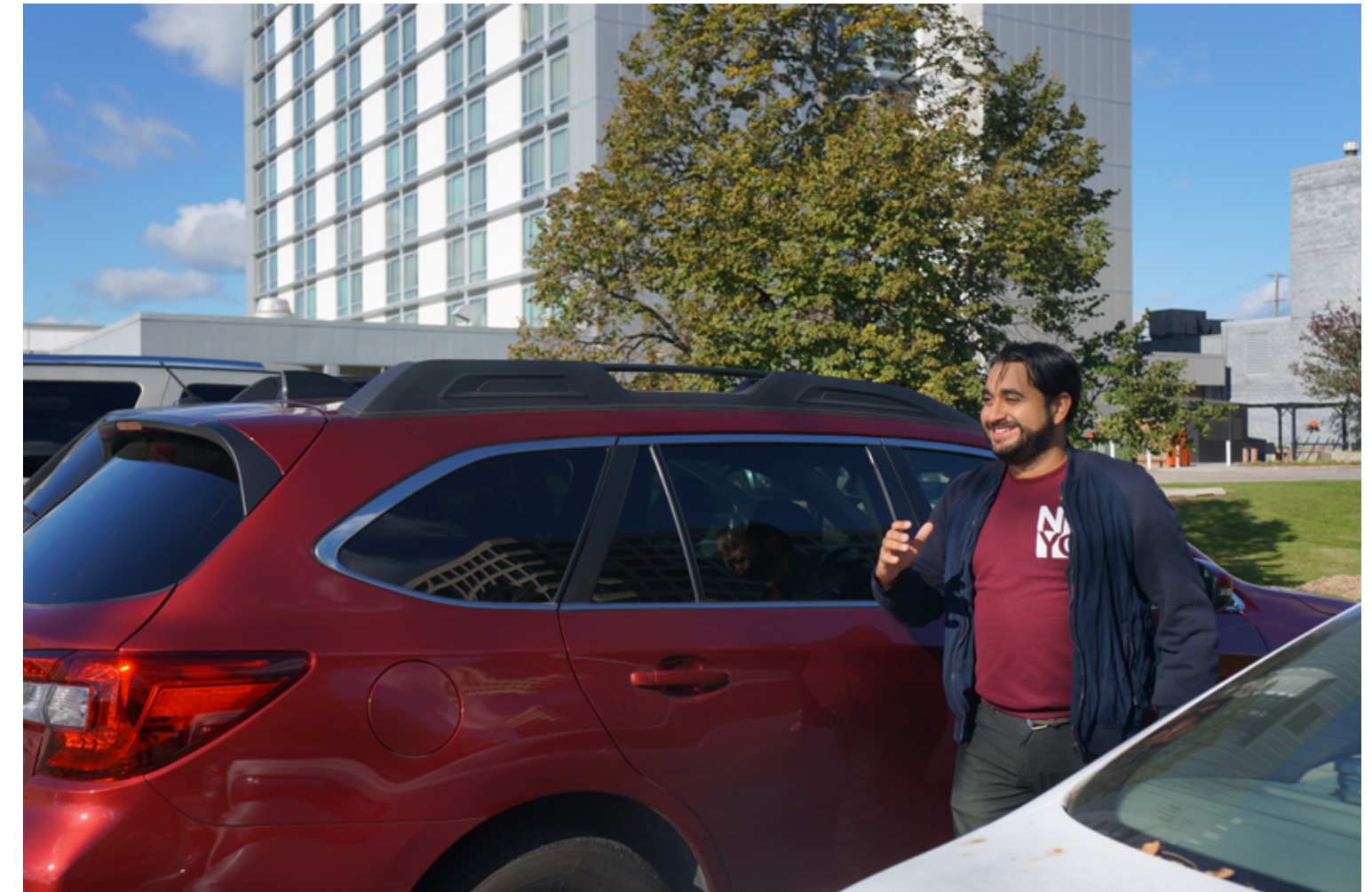
Image Description: There are two photographs shown on this page. The first one features a young man exiting the theatre with his arm outstretched as a young woman in a gray sweater waves goodbye to him. Above each door is an exit sign. The second photo shows a young man walking to his car in the parking lot. Behind him is a red car which matches his shirt